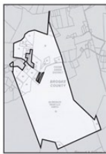
OV ROYALTY TRUST LLC NORTH