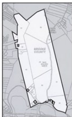
NICK BALLATO NORTH