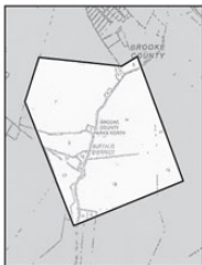
BROOKE COUNTY PARKS NORTH