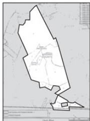
BARRY GREATHOUSE B

Chesapeake pools properties in West Virginia into “units” and is currently drilling in these ten. Units typically slant southeast to northwest so drillers can drill in a straight line and fracture shale rock at an angle that allows more gas to escape. The units contain several adjoining properties and can stretch up to 1,280 acres.